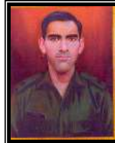
2/Lt PN Dutt, AC (Posthumous) 1/11 GORKHA RIFLES CI Ops J&K – 20 Jul 1997