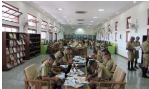
Vyas Library : Reference Section

11. The Academy has a full-fledged Computer Science Department. Limited vacancies are available for the cadets to undergo B.Sc with Computer Science. These vacancies are allotted on the basis of a screening test held at the end of the first week of the commencement of the term.