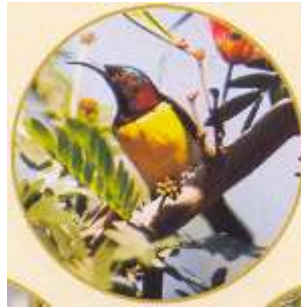
Pied Crested Cuckoo