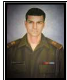
Maj S Unnikrishnan, AC (Posthumous) 7 BIHAR Op Black Tornado – 09 Nov 2009