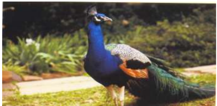
Peacock (Pavo Cristatus)