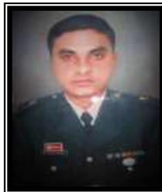
Maj Dinesh Raghu Raman, AC (Posthumous) 19 JAT CI Ops – 02 Oct 2007