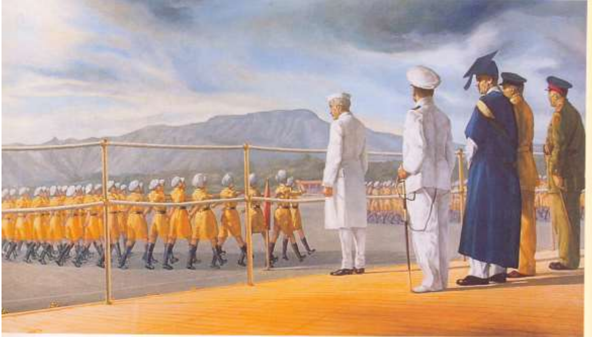
First POP(10 th Course POP) at NDA Khadakwasla, reviewed by Pt Jawaharlal Nehru,Hon'ble PM of India on 05Jun 55

5. The NDA in its various forms has completed sixty years of eventful service to the nation in January 2009. This institution is proud of having produced more than 35,000 officers for the Indian Armed Forces and 800 officers for friendly foreign countries. These officers have imbibed academic and military training of the highest standards in an unique inter-services ambience. NDA is also proud that its alumni have been awarded with nation's highest awards for gallantry and distinguished service, both in peace and war. We cherish with pride the Roll of honour of so many other former NDA cadets who have laid down their lives in battle to uphold the safety and integrity of our country. The NDA has also the distinction of 33 of its alumnus reaching the pinnacle of military achievement by becoming Chiefs of their respective Services are as under :-