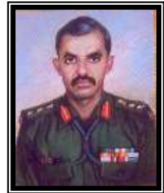
Col NJ Nair, AC (Posthumous), KC 16 MARATHA LI CI Ops Nagaland – 20 Dec 1993