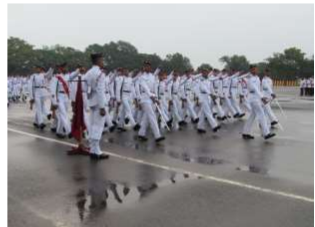
Drill training at Khetrapal Parade Ground