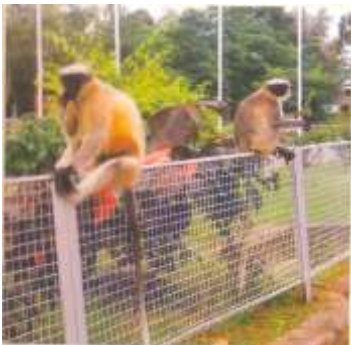
Common Langur (Presbytis Entellus)