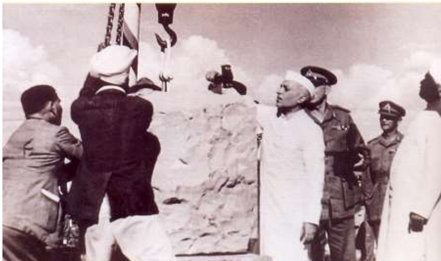
"A Monument in the Making" – Pt Nehru, the Hon'ble PM of India, laying the foundation stone at Khadakwasla on 06 Oct 1949