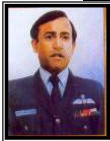
Wg Cdr Rakesh Sharma, AC (Astronaut) Indian Air Force 03 April 1984