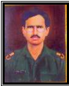
Maj RK Joon, AC (Posthumous), 22 GRENADIERS CI Ops J&K – 16 Sep 1994