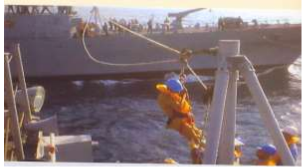
Naval Cadets undergoing training on a Ship

10. A major portion of the curriculum is conducted in the academic class rooms. The academic syllabus is so formulated that it is an integrated one, designed to meet the specific requirements of the Armed Forces. Cadets are taught a large number of subjects of Science, Computer Science and Social Science. The aim is to provide broad based education to widen horizons and make them capable of understanding and tackling problems that may confront them in their service careers. They are also given training in military science so that they understand the military technology in order to exploit the modern weapon-systems in the Armed Forces.